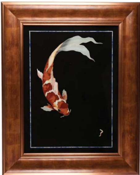
Koi carp plaque by Thomas Greenaway.

Pietra dura, the ancient art form also known as 'Florentine mosaic', is still produced by traditional methods in rural Northamptonshire.