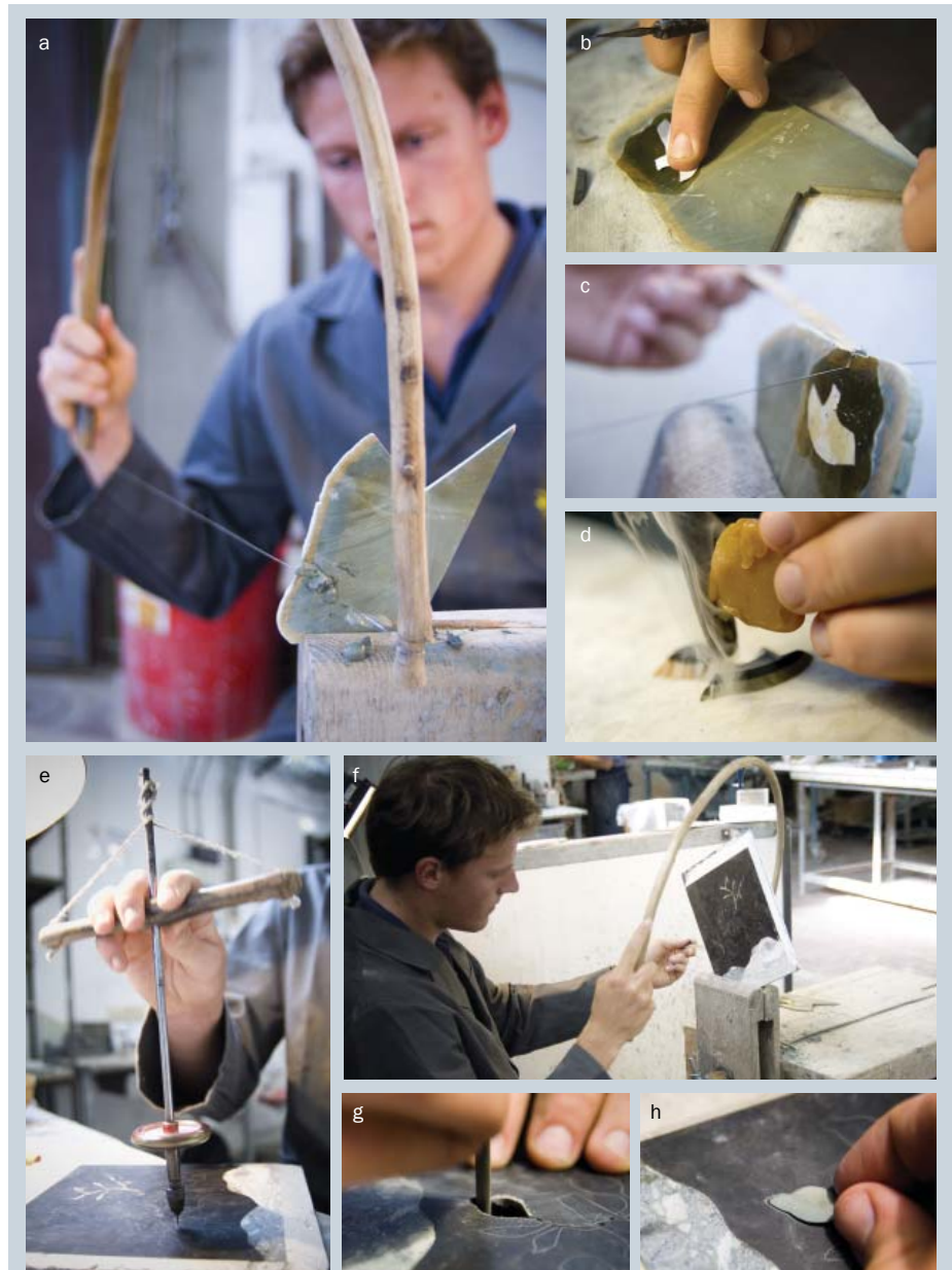
Pietra dura production. (a) A chestnut bow saw is used for cutting. (b) Paper templates are stuck down to a selected area of the stone. (c) Cutting around the template at a 30° angle. (d) Gluing the pieces together. (e) Drilling holes to thread the iron wire through. (f) Sawing the Belgian black marble. (g) Filing the aperture to fit the pieces in to. (h) Fitting the pieces without any gap.

Thomas notes that the greatest change since the late nineteenth century has probably been in the cost of labour and materials. He says: "Sadly many Florentine mosaicists are going out of business and I now know of only about 17 small firms still in production, many of whom are struggling with less than five employees. Rather than 1000 involved in the trade in its heyday, I expect there are now about 50, and there is a great absence of youth." He also notes that nowadays all the processes, from design to finishing, are usually done by one person rather than by a number of specialists,