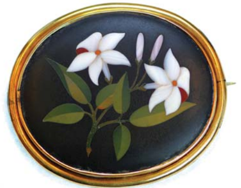
A Victorian pietra dura brooch.